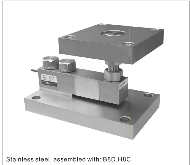
Stainless steel, assembled with: B8D,H8C