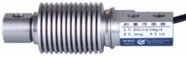
Model BM11 Series