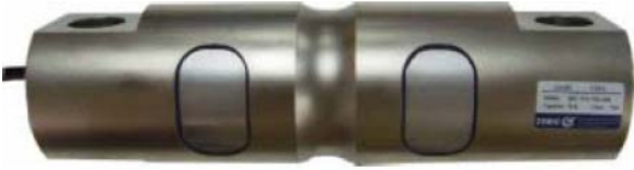
Model H9C / B9C Series