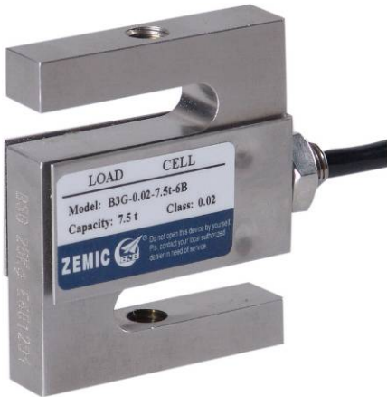
Models B3G, H3G, H3F and H3